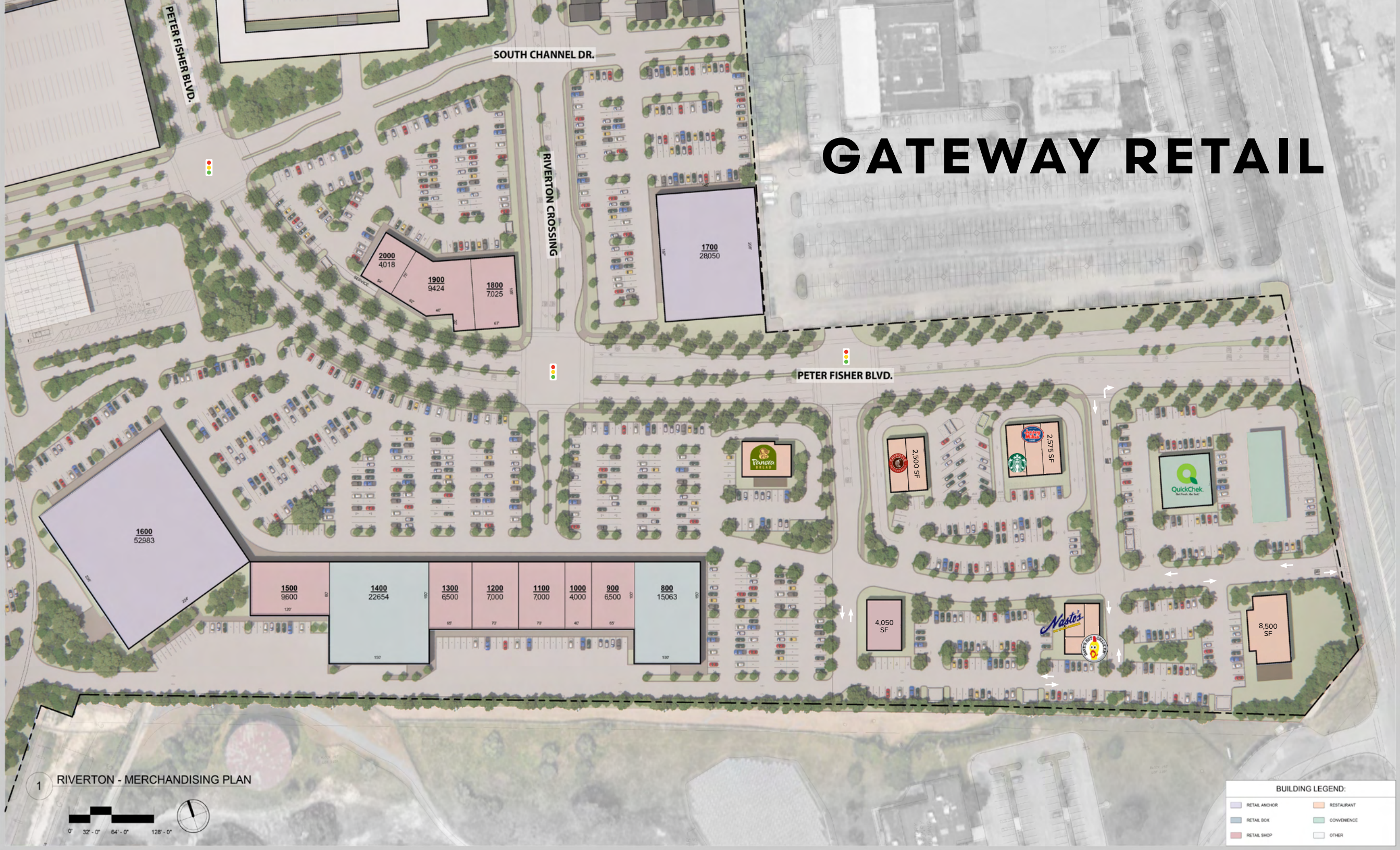
1 RIVERTON - MERCHANDISING PLAN