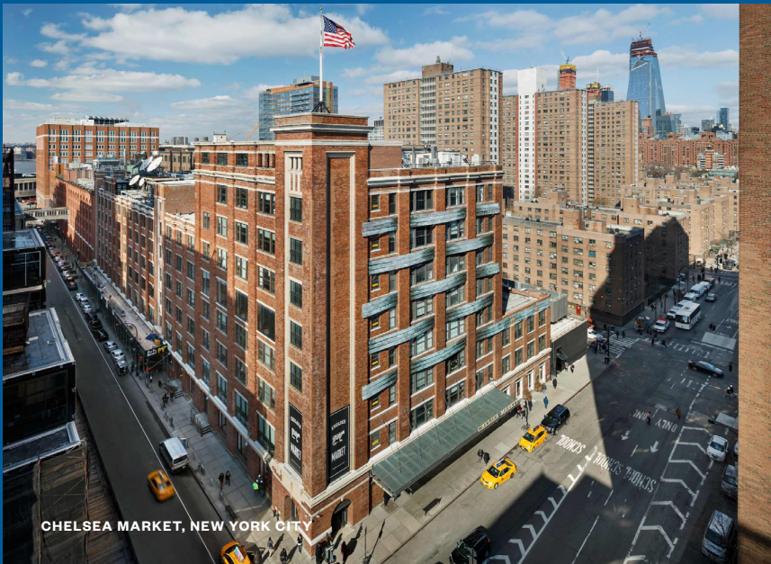
CHELSEA MARKET, NEW YORK CITY

For more information, visit http://www.jamestownlp.com .