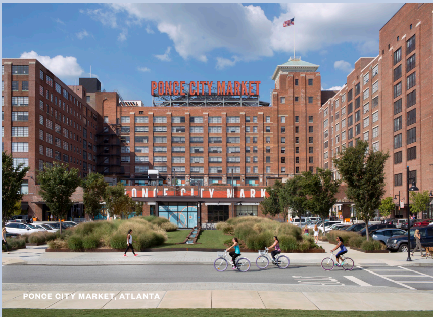
PONCE CITY MARKET, ATLANTA