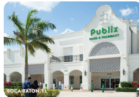
BOCA RATON, FL