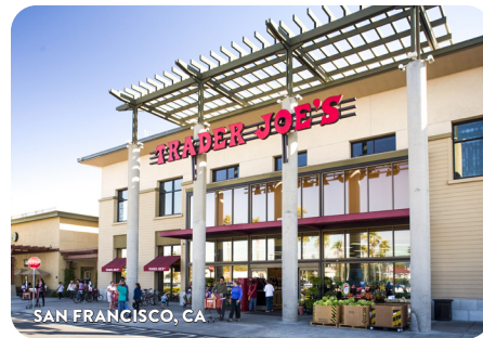
SAN FRANCISCO, CA