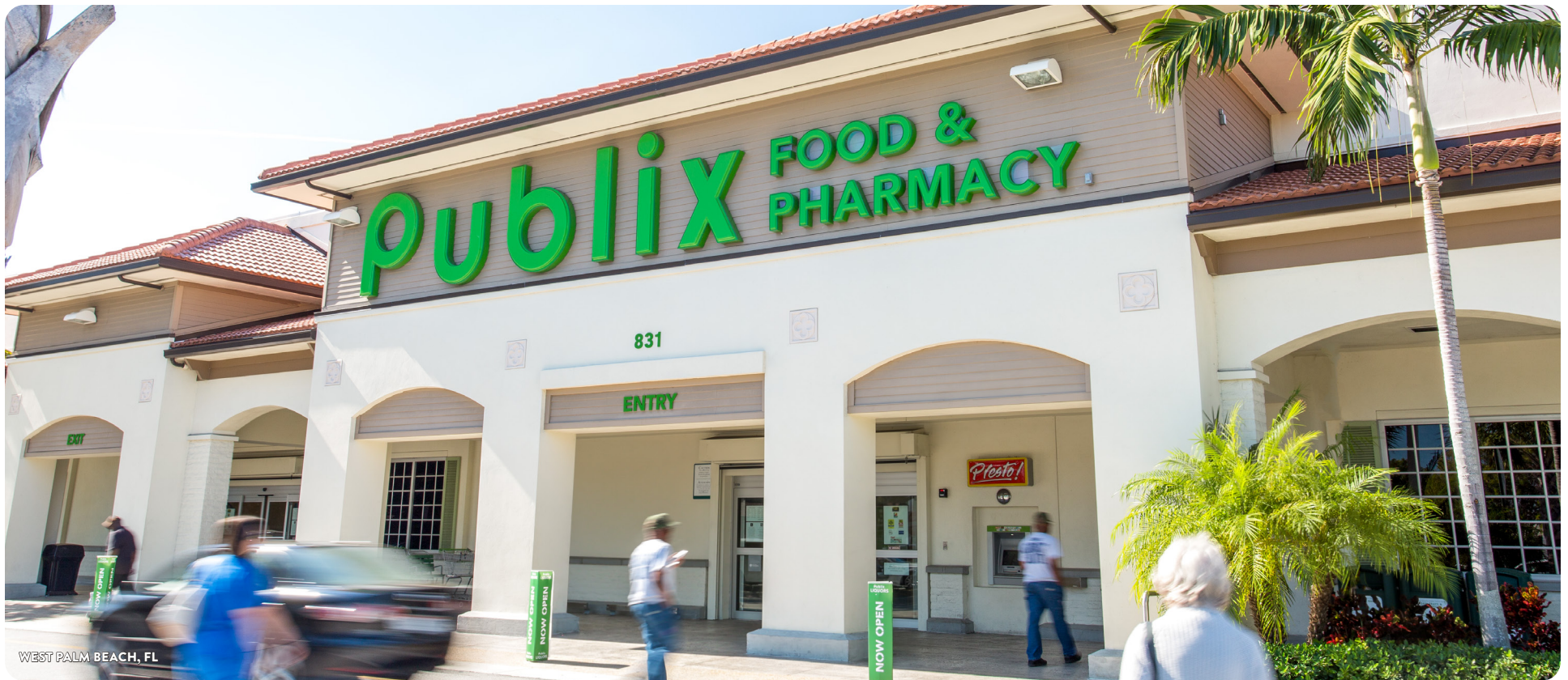
WEST PALM BEACH, FL