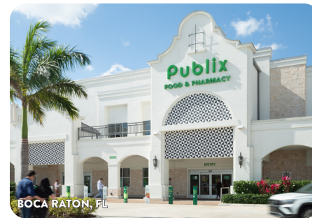
BOCA RATON, FL